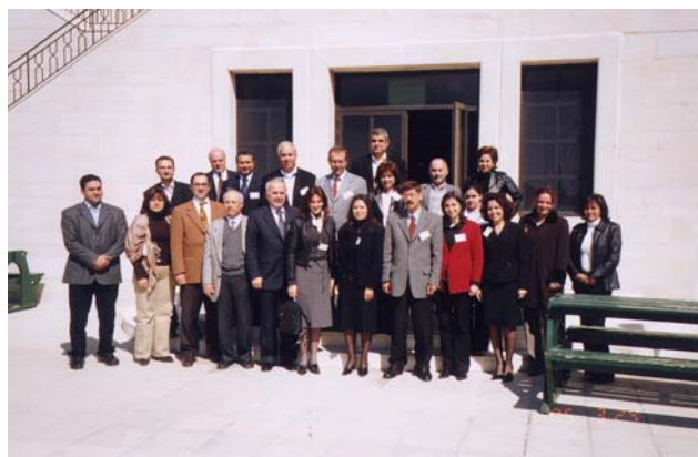
Participants at the Balamand University.